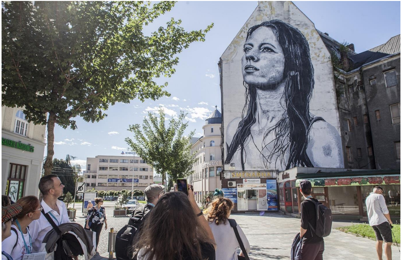
Image 8: Revitalization of Public Spaces in Ostrava – REFILL workshop

highlighted by numerous members of the public, particularly as part of the preparation process for the Ostrava City Strategic Development Plan (described above). It has also been discussed by the working group created as part of the REFILL programme (URBACT). Within this group, the Office of the Head Architect at Ostrava City Authority meets with representatives of various NGOs, architects, urban planners, cultural organizations, social geographers, and other experts.