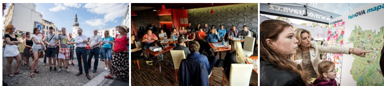
Image 3: Preparation of Strategic Development Plan 2007-2023 – participation of citizens

As part of the process of creating the Strategic Development Plan (SDP), working groups were set up featuring invited experts from the City Authority, representatives of NGOs and other experts. Members of the public were also involved in the process; 250 experts and 20 thousand citizens out of which 6 800 contributed their suggestions and ideas via internet application. These suggestions were not only used in creating the SDP; they were also made available to the public as open data to be used in devising their own initiatives and projects. Citizens were also able to express their opinions and ideas on environmental issues at four public discussion sessions featuring the Mayor and representatives from Ostrava's largest municipal districts. There were also two major meetings with experts, which generated specific proposals for ways of improving Ostrava's environment.